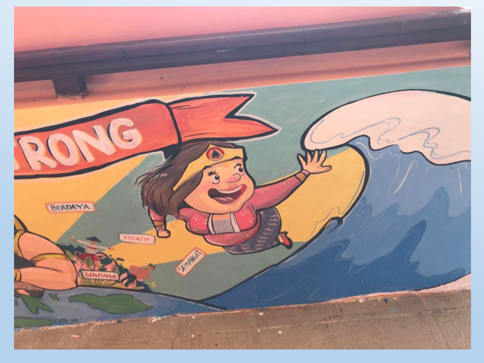
Field study to a tsunami prone area and visit to a tsunami evacuation tower